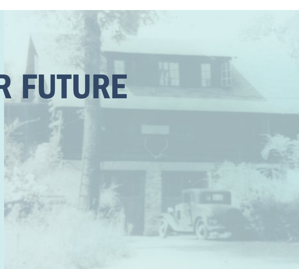
The Carby House still stands at the entrance of Hale.